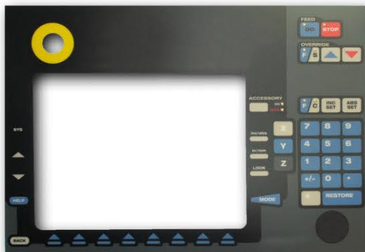
With Surface Mount LEDs